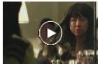
Trich - Shortfest trailer Jun. 13, 2012