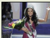
Miss USA 2012 is crowned