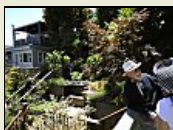
Telegraph Hill gardens open up