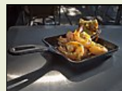
Corners Tavern in Walnut Creek