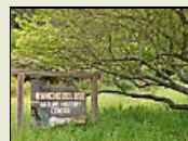
The top camping spots and lakes